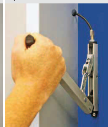
Mechanical emergency release