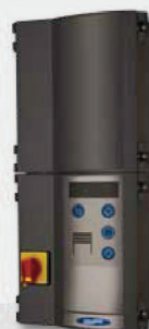
Standard control unit: T100R FU

Options: see page 13 for details of all the options offered for the NovoSpeed Flex.