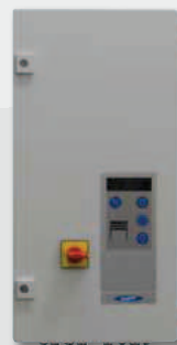
T100R FU 3 kW