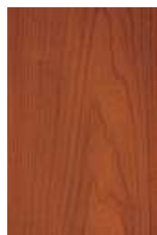
DURAT cherry (wood imitation)