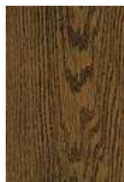
Berg Eiche rustikal