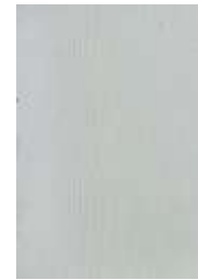
DURAT ash grey (wood imitation)