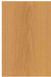
DURAT beech (wood imitation)