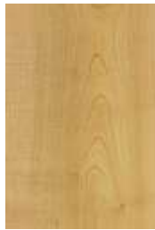
DURAT maple (wood imitation)

This shows, as promised, - DURAT finish - a decor for the discerning customer!