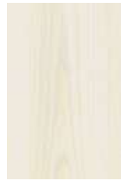
DURAT ice-ash (wood imitation)