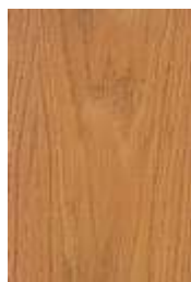
Berg eiche hell