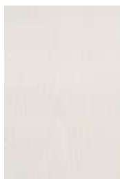
DURAT ash white (wood imitation)