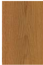
DURAT oak (wood imitation)